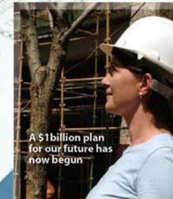
A $1 billion plan for our future has now begun