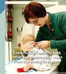
Community health to look after our community more from the young to mature